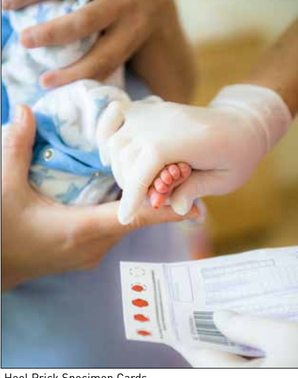
Heel Prick Specimen Cards