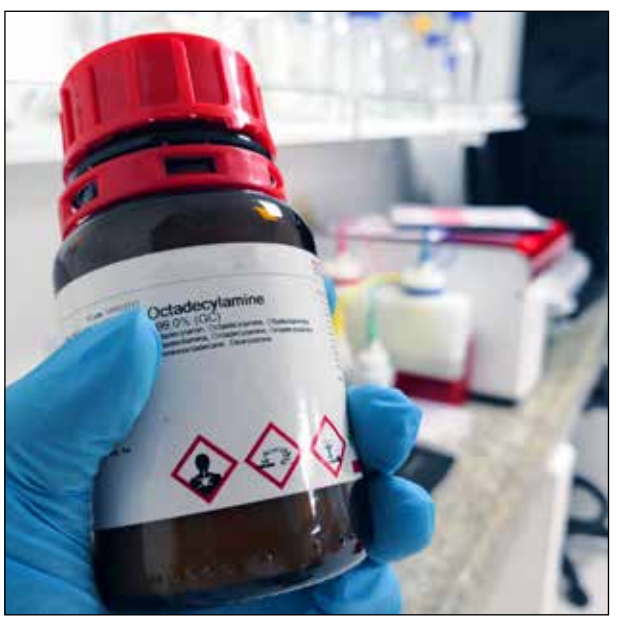
2-color labeling for hazardous warnings